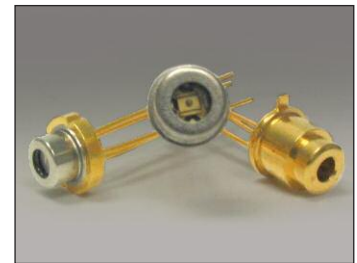
Laser / photonic devices