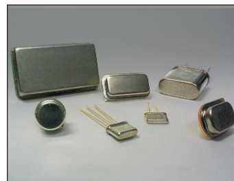
RF and hybrid devices